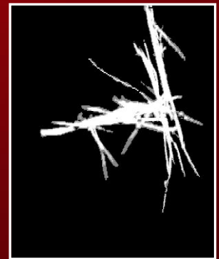
A 9mm shive detected by the FQA-360

A published report (Joss et al, Appita J, 2006) found that 3 morphological parameters are required to properly describe a shive: Effective Length, Shive Area and Branch Index. The FQA-360 measures all 3 of these parameters.