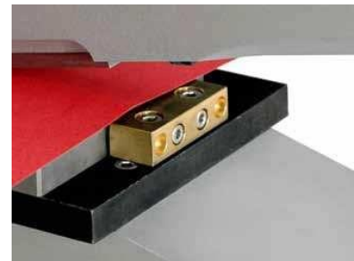
The material to be punched is placed on the lower blade