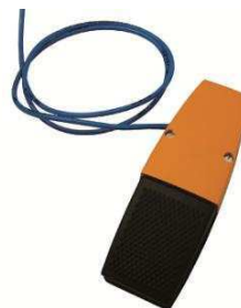
Foot switch for pneumatic model